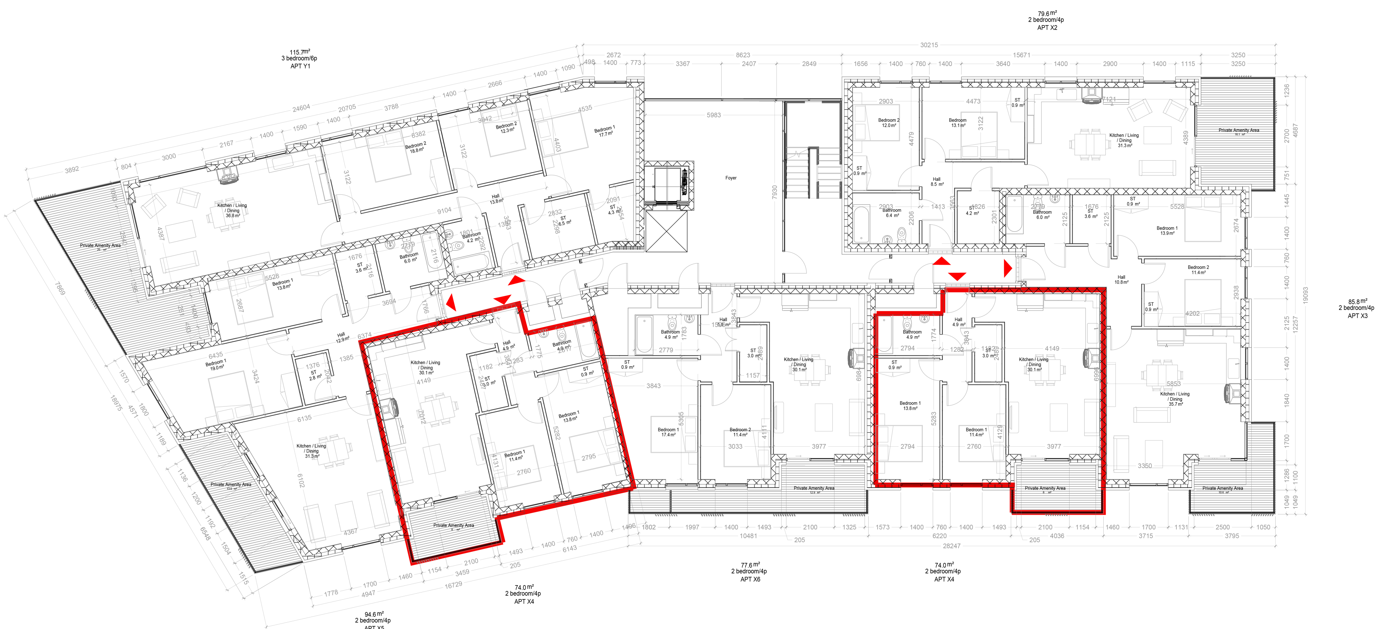
Block B -First Floor Plan 1:100